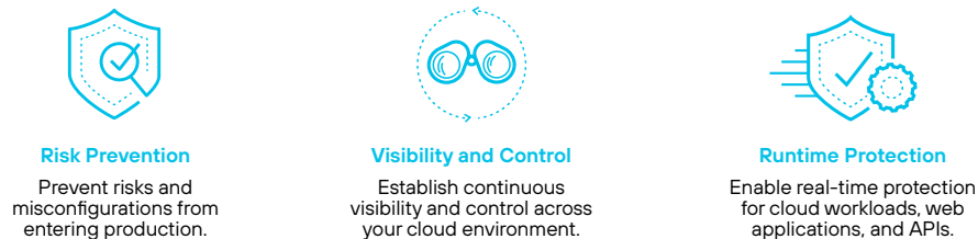
Figure 1: Prisma Cloud's unified approach from code to cloud

Prisma® Cloud is a single-vendor, cloud-native application protection platform (CNAPP) designed to protect applications across any public, private, hybrid, or multicloud environment. Unlike point tools, Prisma Cloud integrates a broad set of security capabilities into a single platform to deliver unified, best-in-class security. The benefits of our approach include reduced risk, fewer breaches, better DevSec collaboration, increased efficiency, and improved compliance and security posture.