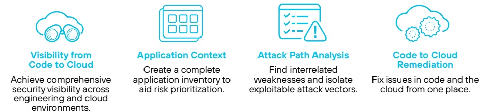
Figure 3: Code to Cloud intelligence

Our unique approach is powered by Code to Cloud™ intelligence, connecting insights from the developer environment through application runtime to reduce risk and prevent breaches. Prisma Cloud contextualizes alerts, prioritizes critical risks, and offers remediation guidance.